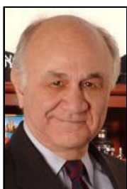
NICHOLAS SCOPPETTA: Singed by unions.

Firefighter unions denounced Fire Department changes in inspection procedures last week, calling them cosmetic, lacking in substance and counter-productive.